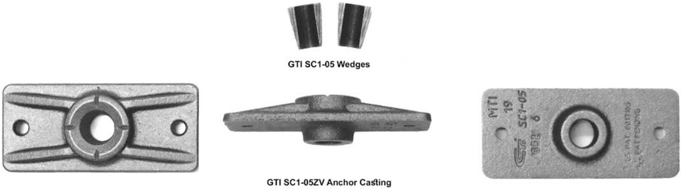
FIGURE 1—GTI ZERO VOID® POST-TENSIONING SYSTEM COMPONENTS

are identified by embossments with the product name designation and date lot codes. Packages of the anchor castings, machined anchors, couplers and wedges are labeled with the company name (General Technologies, Inc.) and address, part designation and tracing codes, and the evaluation report number (ESR-2515).