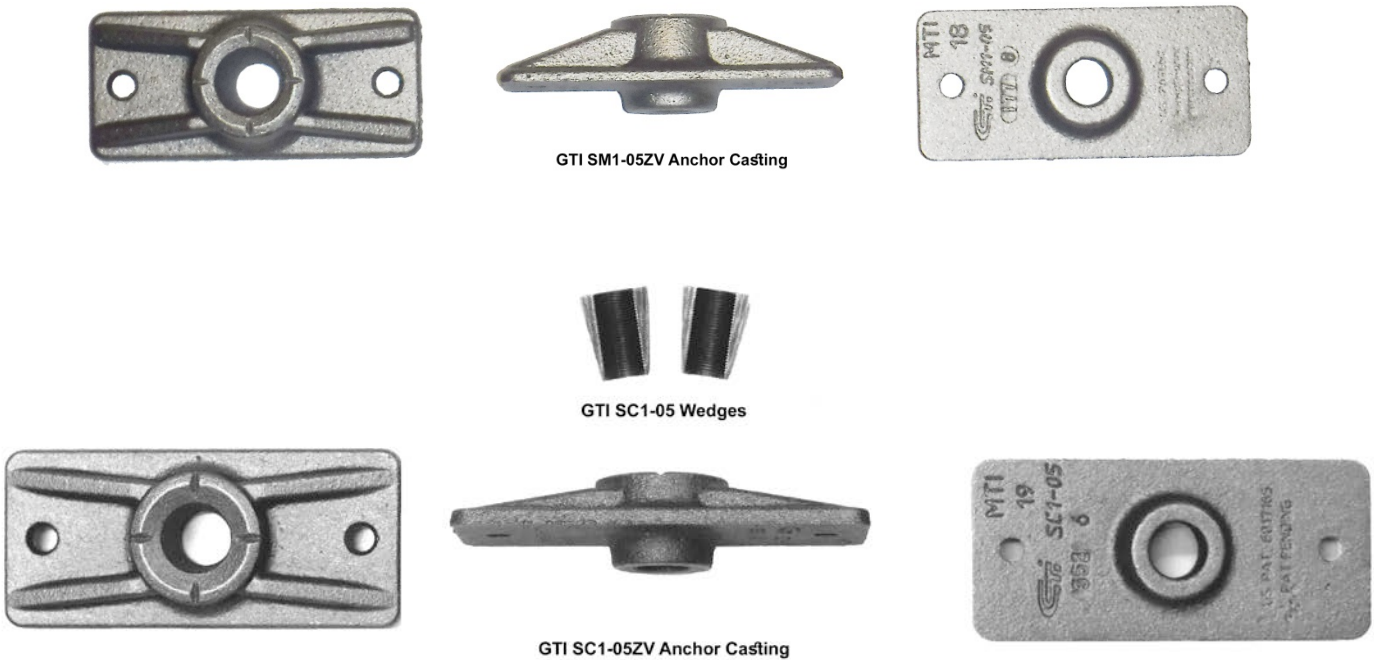
FIGURE 1—GTI ZERO VOID® POST-TENSIONING SYSTEM COMPONENTS

GENERAL TECHNOLOGIES, INC. POST OFFICE BOX 1503 STAFFORD, TEXAS 77477 (281) 240-0550 www.gti-usa.net sales@gti-usa.net