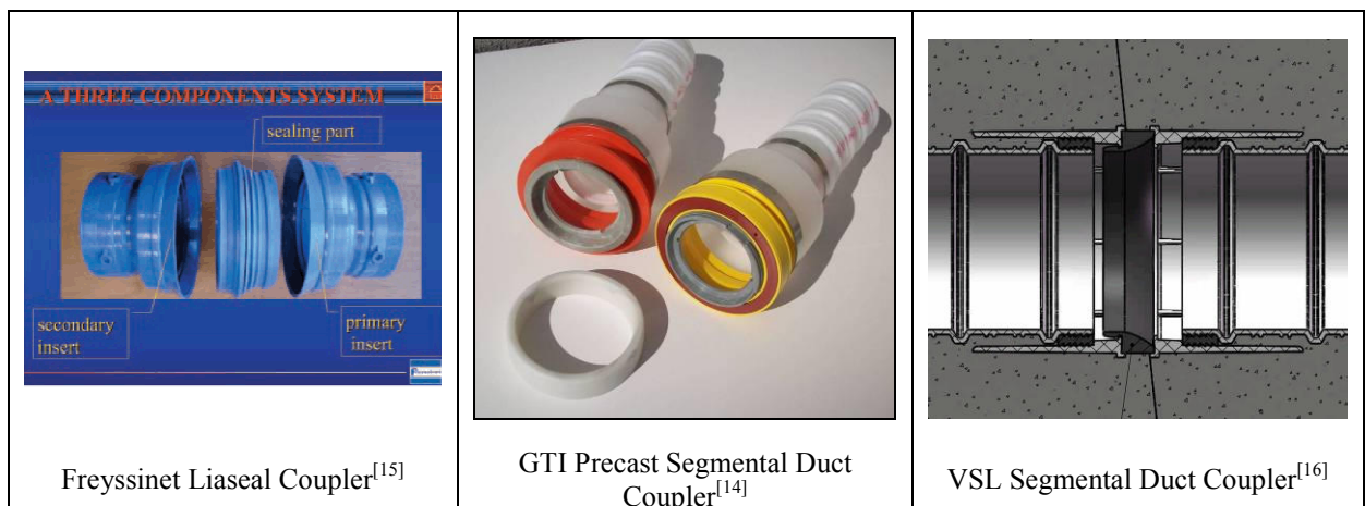
Fig. 3 Precast Segmental Duct Couplers

Today, there are several manufacturers producing segmental duct couplers (see Fig. 3 ). When evaluating segmental duct couplers, designers and contractors should confirm their ability to create an airtight and watertight connection in addition to allowing correct alignment and positioning of ducts (15 degrees or more horizontal or vertical angle at some joints is necessary). From a constructability standpoint, segmental duct couplers need to be robust and user friendly for ease of installation at jobsites allowing field tolerance up to 6 mm in any axis. Segmental duct couplers must include the ability to maintain individual tendon integrity thereby preventing grout crossovers or epoxy leaking into the tendon. [13][14]