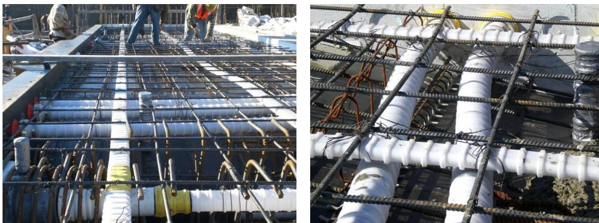
Fig. 1 Corrugated Plastic Duct in Segments prior to Concrete Placement

In current economic times, material costs play a major role in decisions regarding product choice. When comparing the costs of corrugated plastic duct versus thin-wall metal duct, it was noted in fib Bulletin 7 [11] that because of small production quantities plastic ducts may cost twice that of metal duct. Ducts represent roughly 5% of the total installed post-tensioning price and the post-tensioning price represents more or less 10% of the total construction cost of a bridge. Hence, doubling the duct price represents about 1/2 % increase in construction costs while providing a significant improvement in the durability and quality of the main reinforcement of a structure. [11] Today, production of corrugated plastic duct has significantly increased since fib Bulletin 7 [11] was written, resulting in considerably less cost disparity between duct types.