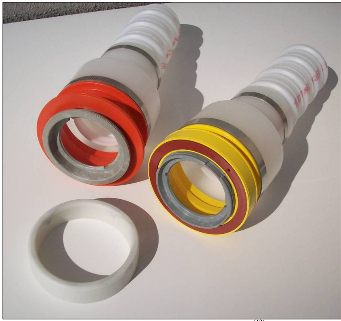
Figure 1 – Precast Segmental Duct Coupler.<sup>(13)</sup>

In 2002, the Florida Department of Transportation (FDOT) recognized the critical nature of segment joints and in New Directions for Florida Post-Tensioned Bridges <sup>(14)</sup> made a determination that segmental duct couplers would be used on all FDOT Segmental Concrete Bridge Projects. Performance testing of segmental duct couplers should include at a minimum: sealing gasket compressive required force test, air pressure test, and assembly toughness test. FDOT Post-Tensioning Specifications<sup>(15)</sup> include dialogue on this testing. Acceptance criteria include: