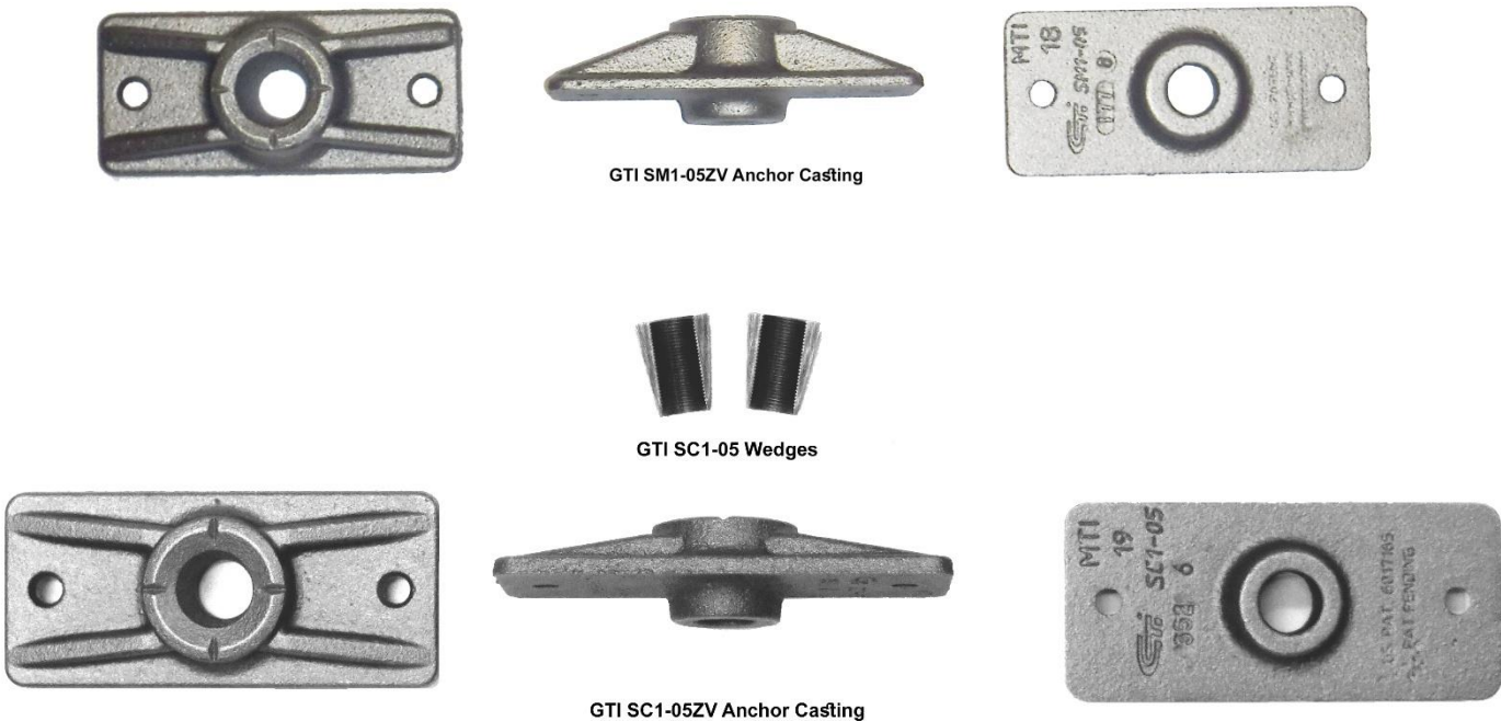
FIGURE 1—GTI ZERO VOID® POST-TENSIONING SYSTEM COMPONENTS

GENERAL TECHNOLOGIES, INC. POST OFFICE BOX 1503 STAFFORD, TEXAS 77477 (281) 240-0550 www.gti-usa.net sales@gti-usa.net